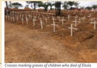
Crosses marking graves of children who died of Ebola